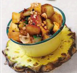
Assorted Fruit Rojak 水果罗惹