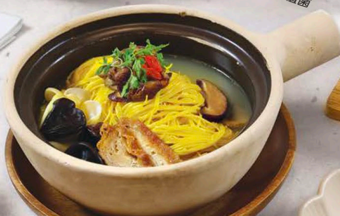
Bak Kut Teh with Turmeric Noodles 松耳肉菇茶黄姜面