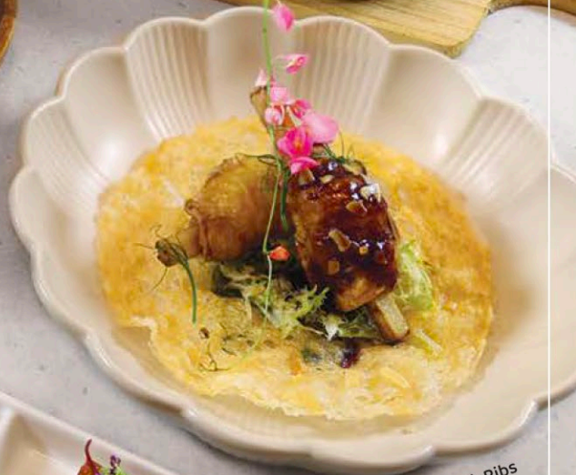
Coffee Pork Ribs 咖啡素玉排