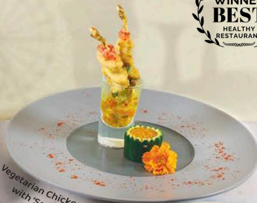
Vegetarian Chicken Skewer with 'Satay' Sauce 沙爹素植菌