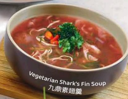
Vegetarian Shark's Fin Soup 九鼎素翅羹