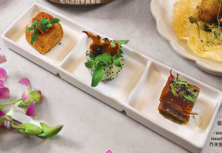
LingZhi Trio Appetiser 灵芝三品